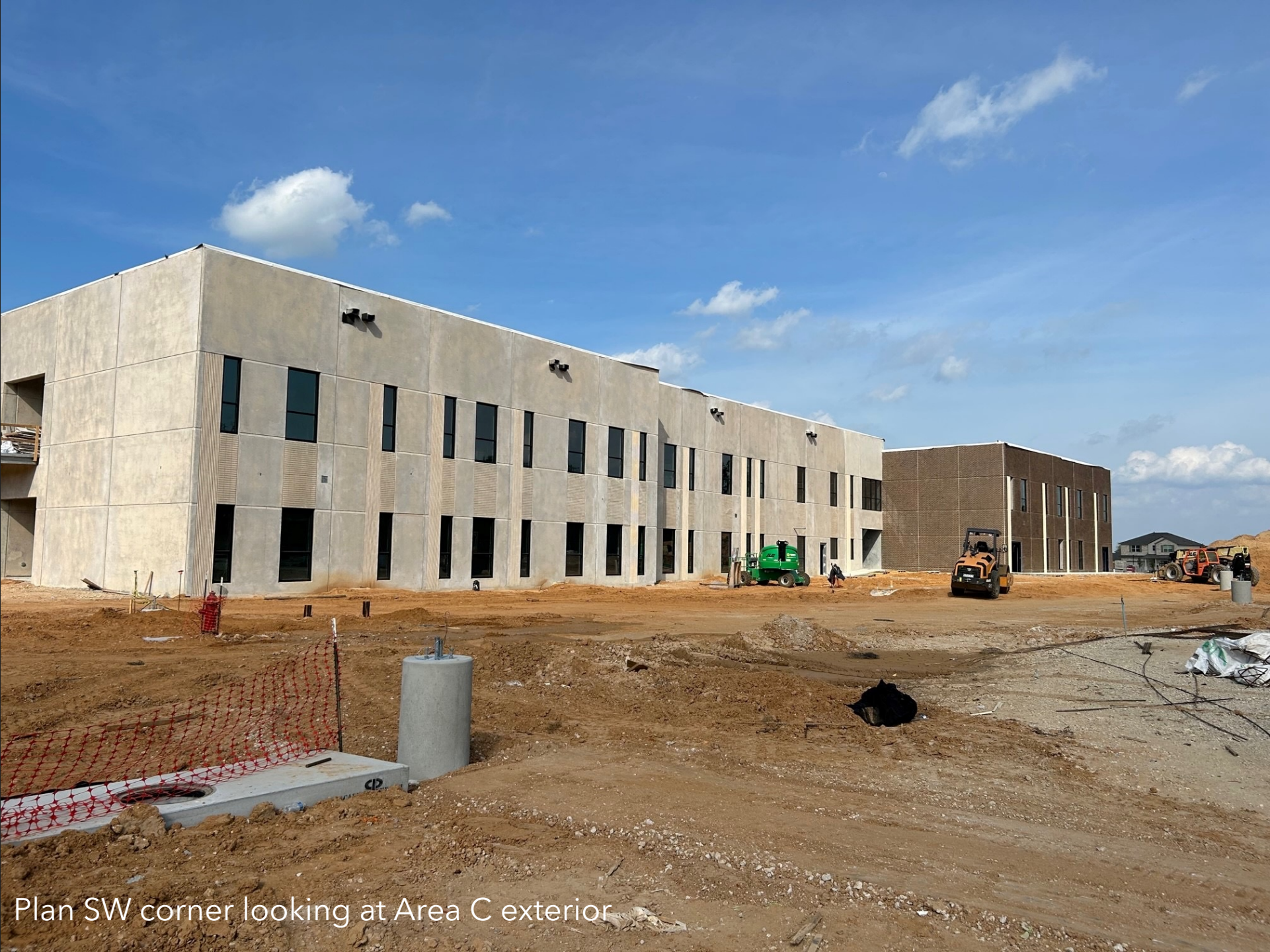
Plan SW corner looking at Area C exterior