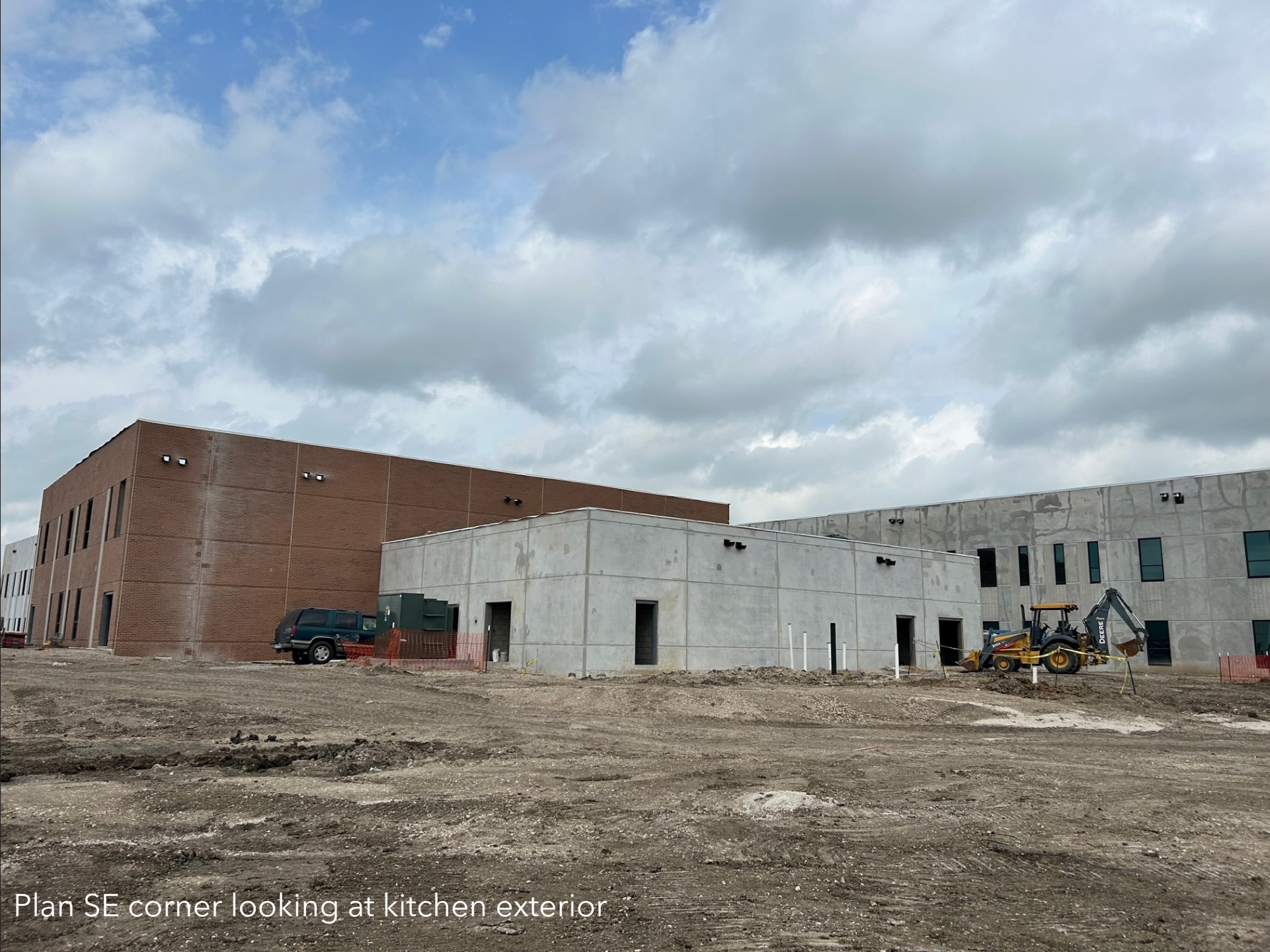
Plan SE corner looking at kitchen exterior