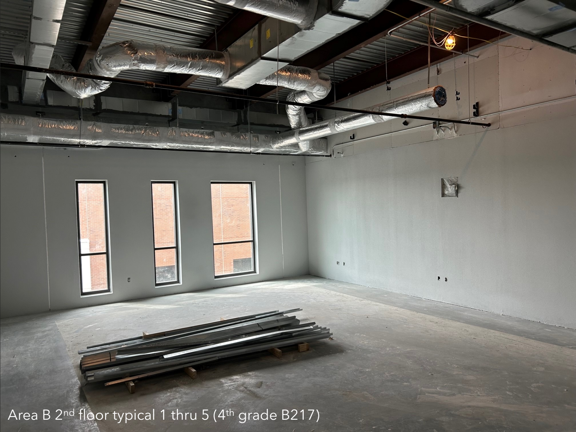
Area B 2 nd floor typical 1 thru 5 (4 th grade B217)