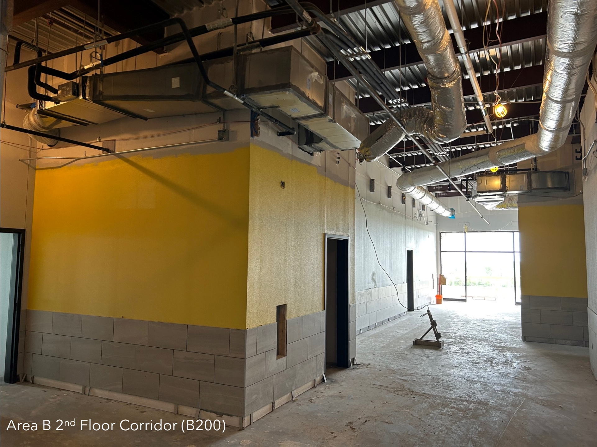
Area B 2 nd Floor Corridor (B200)