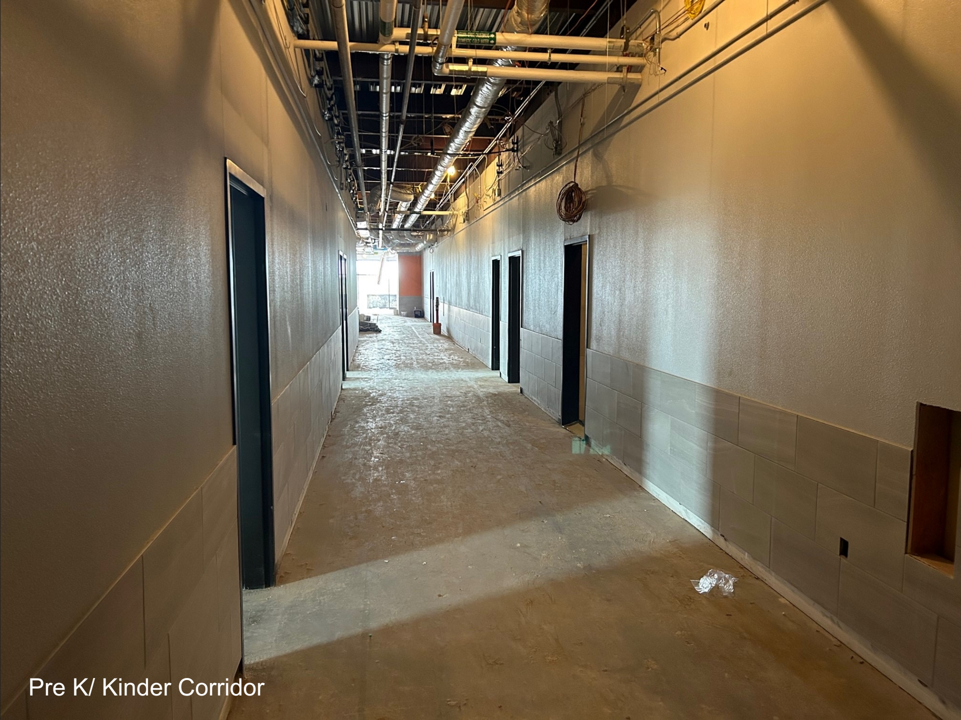
Pre K/ Kinder Corridor