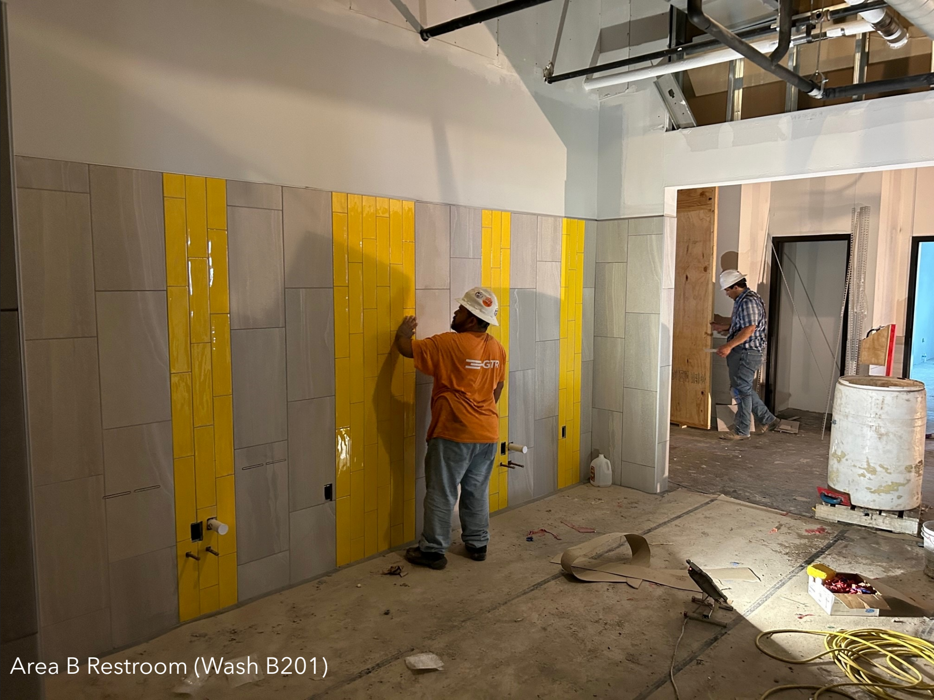
Area B Restroom (Wash B201)