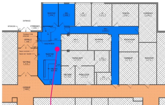
A1 AREA FLOOR PLAN 100' x 70'