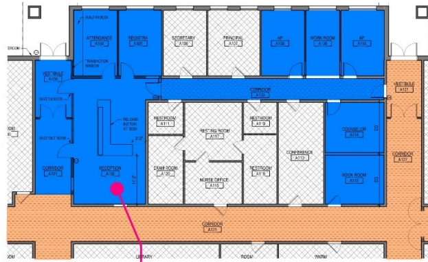
A2 A11 AREA FLOOR PLAN 1/8" = 1'-0"