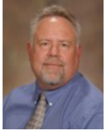
By Skip Forsyth

For many children in Texas, Memorial Day is more than parades and barbecues and solemn ceremonies; it is the commencement of summer vacation.