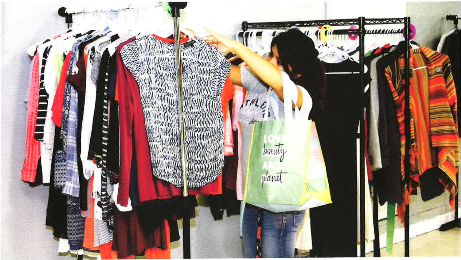
▲ A student in Bastrop ISD browses the donated clothes offerings in Christian's Closet.