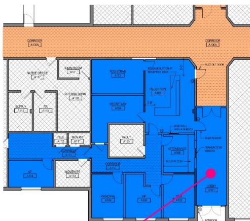
LEVEL 1 AREA FLOOR PLAN A111 1/8" = 1'-0"